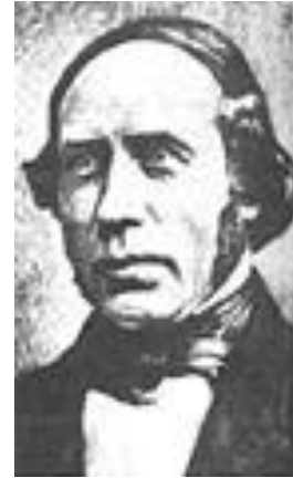
Korla Awgust Kocor

Zejler wrote the words to the Sorb National Anthem, "Beautiful Lusatia", and Kocor set it to music, choosing, very unusually, a minor key, creating a very slow, melancholic and impassioned anthem. The Anthem was then first performed at the first Sorb singing festival in 1845 in Bautzen, a tradition started by Kocor himself to promote the Sorb culture.