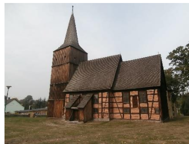
Klepsk (Klemzig) church

She offers to assist in these ways for the region around Zielona Gora: