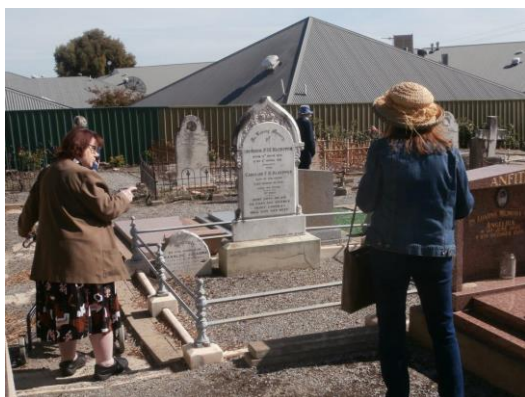
Kloepper grave at Hope Valley Cemetery