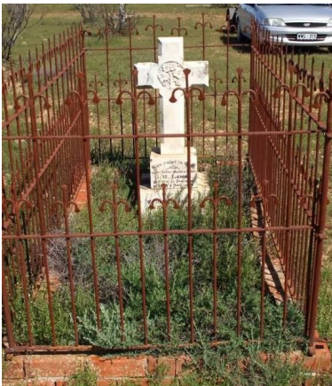
Grave site before restoration