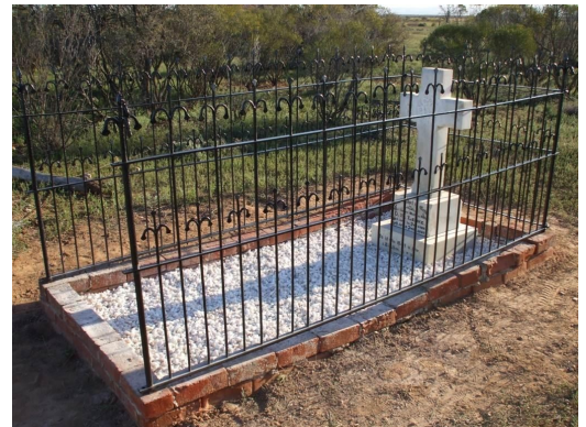
Grave site after restoration

The grave site is now completely restored under a project by the Wend/Sorb Society to recognise a great pioneer and his work, which can be heard every Sunday in the Gruenberg Lutheran Church.